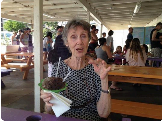
Da kine big fat shave ice!