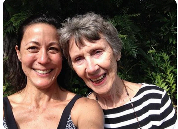
Sharing a day